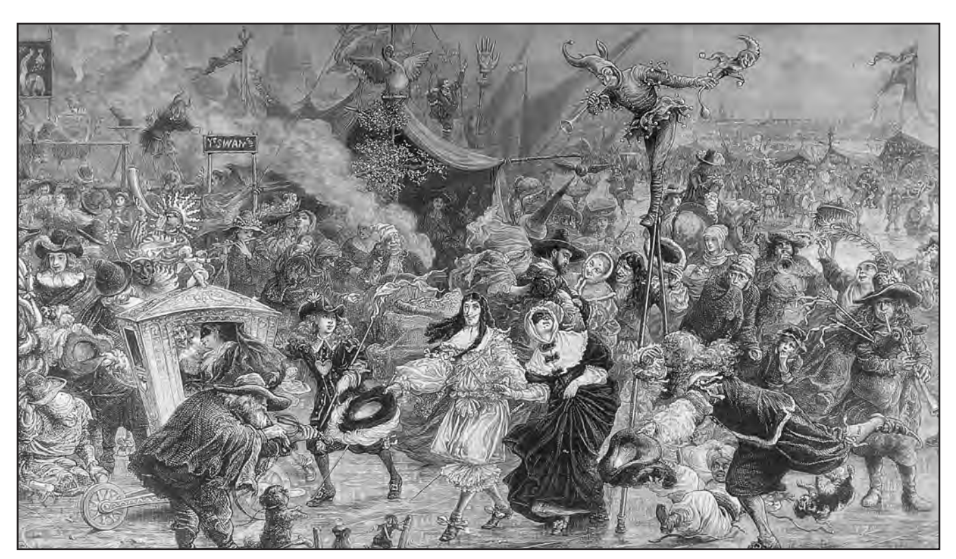
Vanity Fair—Christmas 1683 from Graphic, Christmas Number December 25, 1876

Henry VIII was King of England from 1509-1547. It was during his reign when the Christmas masque came into fashion. The illustration of Henry VIII depicts