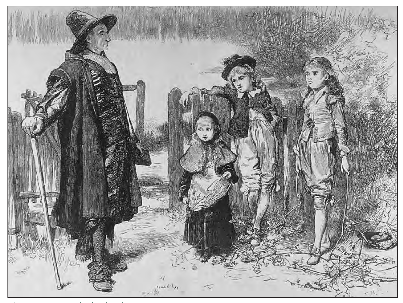
Christmas in New England-Colonial Times from Harper's Weekly, December 25, 1875

fined anyone caught trying to participate in Christmas in any way. However, this law was rescinded twenty-two years later, but it was not until the nineteenth century that New Englanders started celebrating Christmas. Up until then the real seasonal celebration was on New Year's. With the exception, of course, of the German immigrants who celebrated Christmas in America as they did in their native Germany, on December 25th.