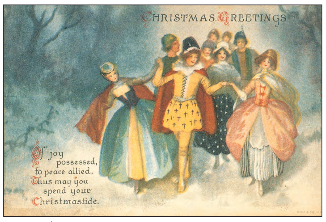
Vintage postcard, ca. 1910