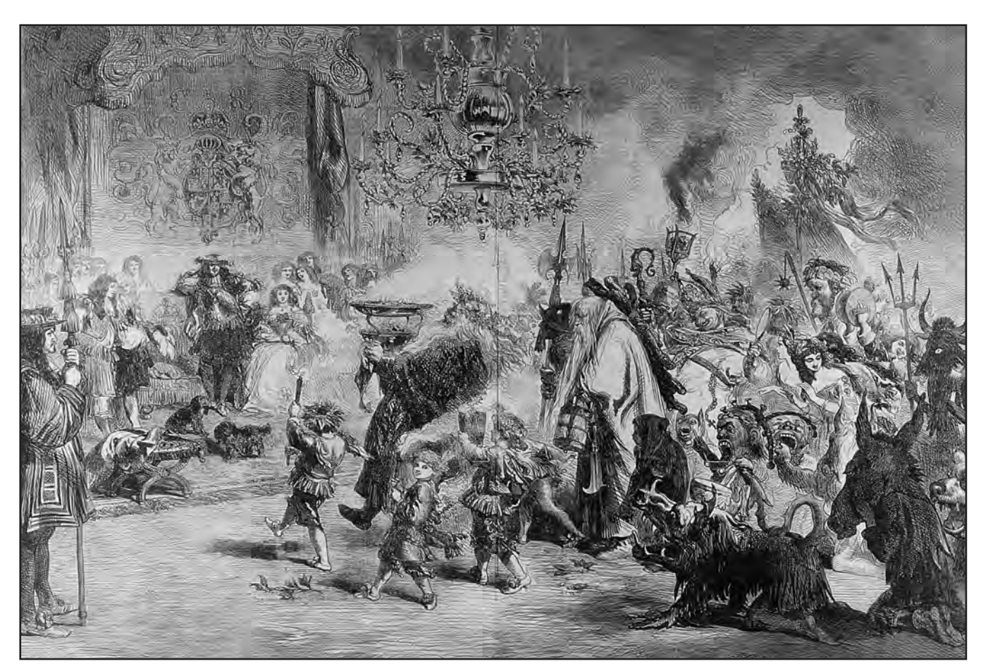
Christmas Masque at the Court of Charles II from The Illustrated London News, December 24, 1859

The custom of mumming had its roots in the Roman