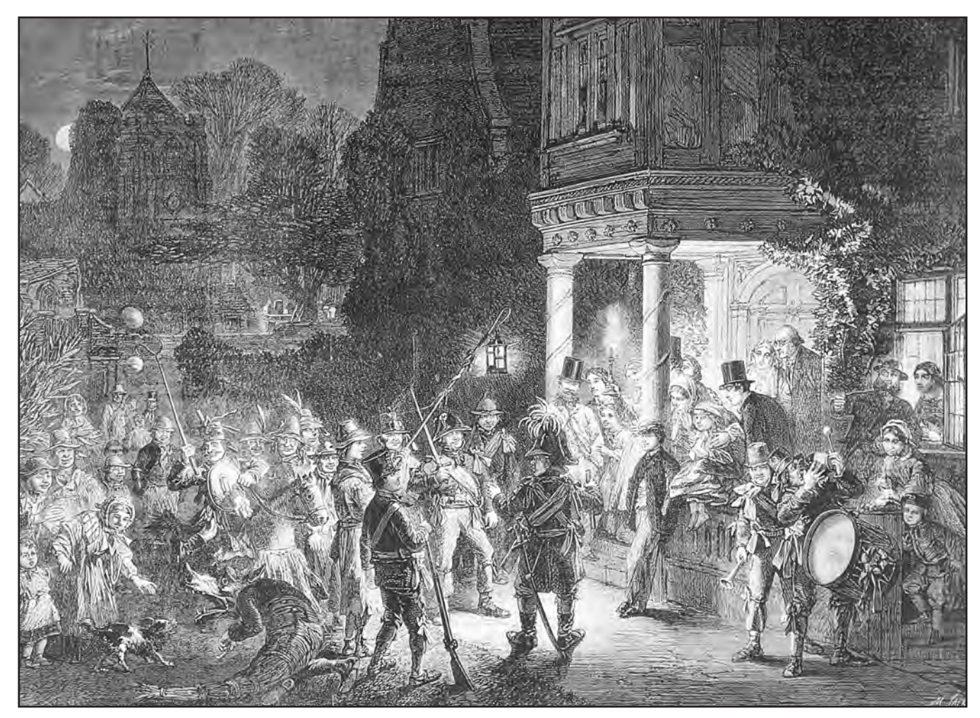
Christmas Mummers from The Illustrated London News, December 21, 1861 By A. Hunt

Minstrels, who added music to the celebrations, sometimes accompanied them.