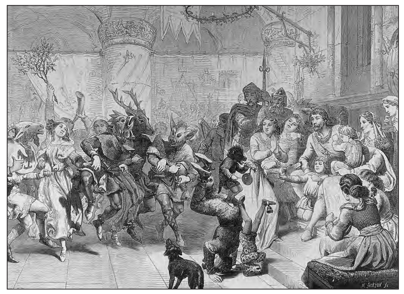
Mummers at Christmas in the Olden Time from The Illustrated London News, December 22, 1866 By E. N. Corbould

celebration called Saturnalia, which started December 17th and lasted for a week. During this celebration, men and women exchanged clothing and participated in wild merrymaking. The mummers in wild disguises would go from house-to-house or court-to-court, partaking in the Christmas cheer and merriment.