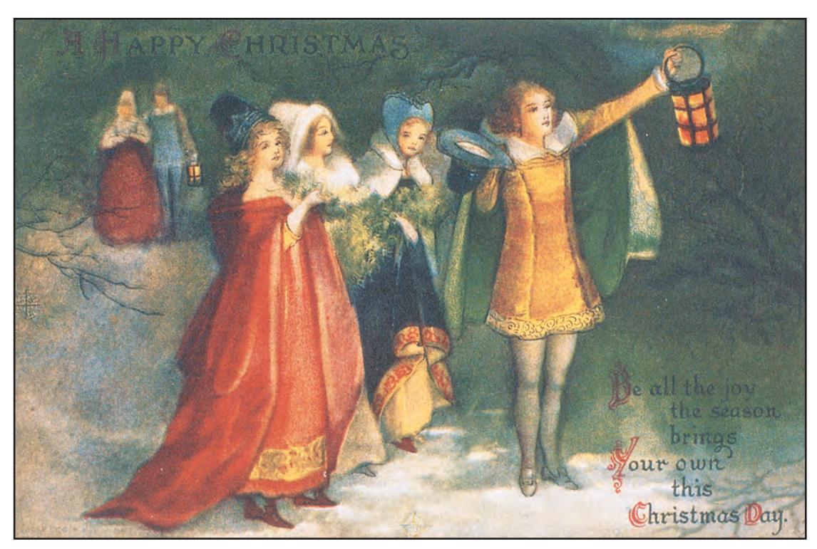
Vintage postcard, ca. 1910