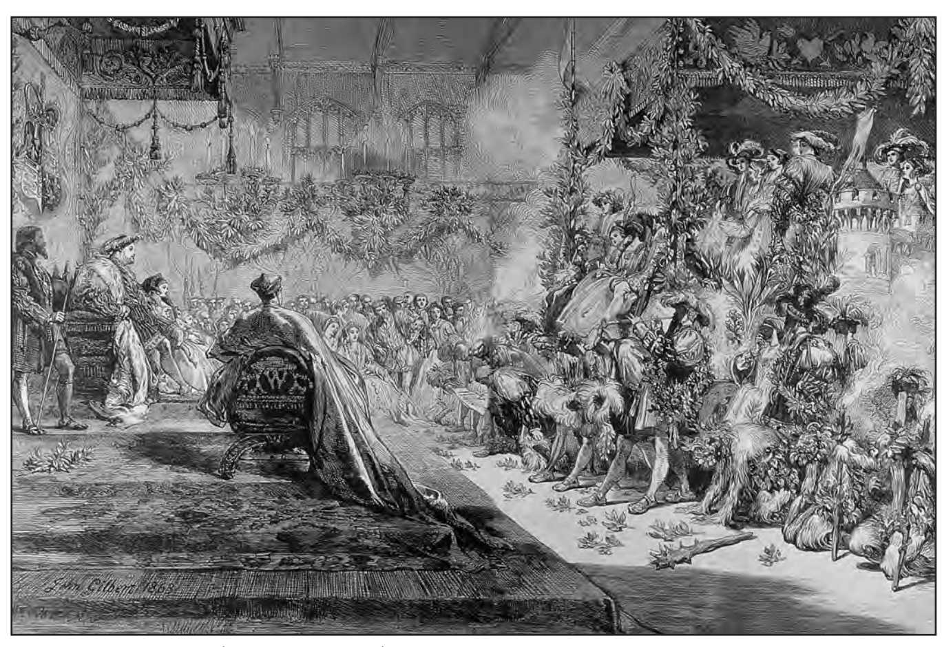
King Henry VIII Keeping Christmas at Greenwich from The Illustrated London News, December 19, 1863 By John Gilbert

great yellow ruff: his torch-bearer carried a basket with a cheese and a rope. Carol had a red cap and a long tawny coat, with a flute hanging at his girdle: his torch-bearer carried a song book, open. Minced Pie was neatly dressed as the cook's wife; her man carried a pie on a dish, and a spoon. Gambol appeared as a tumbler, with a hoop and bells; his torch-bearer was armed with a 'colestaff' and a blinding cloth. Post and Pair had a pair-royal of aces in his hat; his garment was done over with 'pairs and purs:' his squire carried a box with cards and counters. New Year's Gift was like a servingman, in a blue coat, with an orange, and a sprig of rosemary gilt on his head; his hat is stuck full of brooches, and his collar is made of gingerbread: his